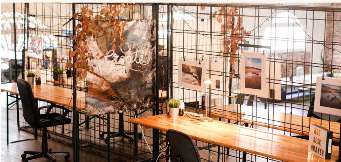
Internal image of the co-working space at Maker + Co, 75 Victoria Street, Bunbury, 2018.

Edith Cowan University (ECU) has been the foundation partner of Maker + Co since inception in August 2016, and occupies an area called the ECU CBD Learning Hub. Working together, ECU and Maker + Co shape contemporary learning environments in which critical thinking and innovation drive positive social impact.