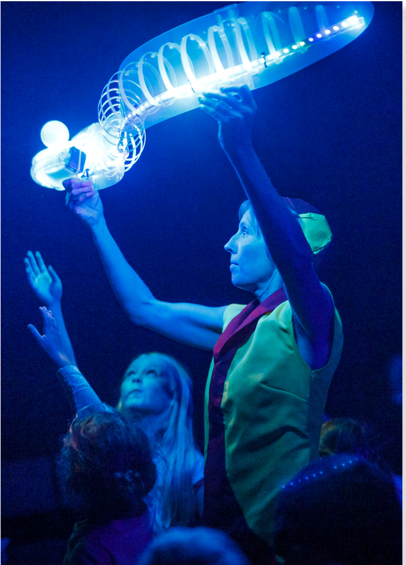
On Our Beach by Spare Parts Puppet Theatre at Spare Parts Puppet Theatre, Fremantle 2019.