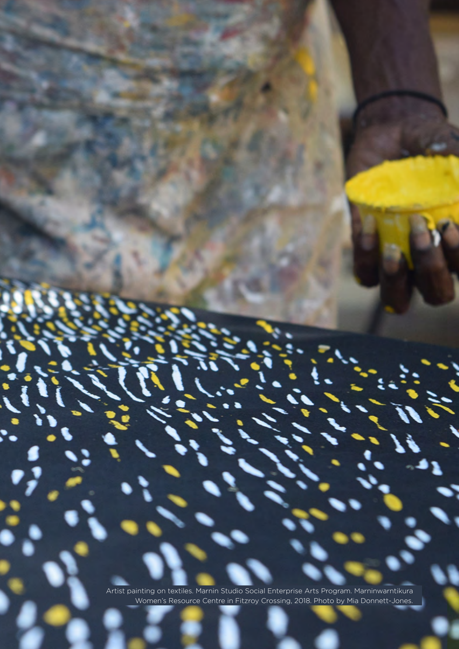
Artist painting on textiles. Marnin Studio Social Enterprise Arts Program. Marninwarntikura Women's Resource Centre in Fitzroy Crossing, 2018.