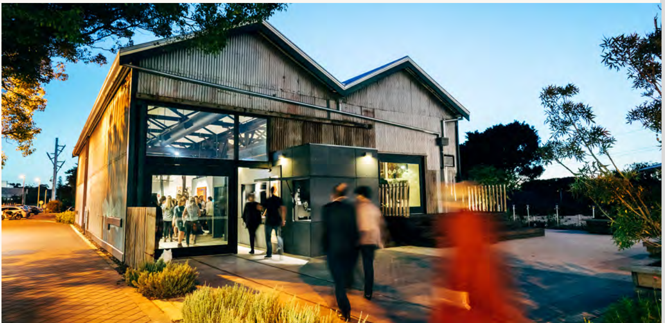
The Goods Shed, Claremont, 2018.

The Goods Shed is the headquarter of Western Australian cultural agency FORM's programming and administration. Offering public engagement with outcomes of FORM's State-wide and international residencies including exhibitions, creative residencies, workshops, public and education programming, the space offers a new model for visual arts programming in WA, and a creative space where visiting artists can develop and premiere new and experimental work in direct conversation with both metropolitan and regional audiences.