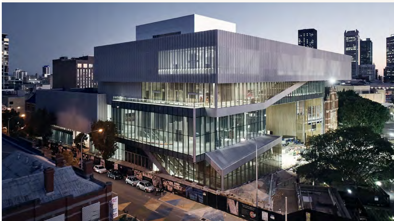
Top images: WA Museum Boola Bardip Hackett Hall and cantilever (left) and James Street view (right).