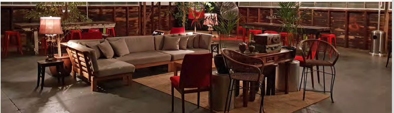
Workshop at The Exchange—Carnamah by North Midlands Project, April 2019.