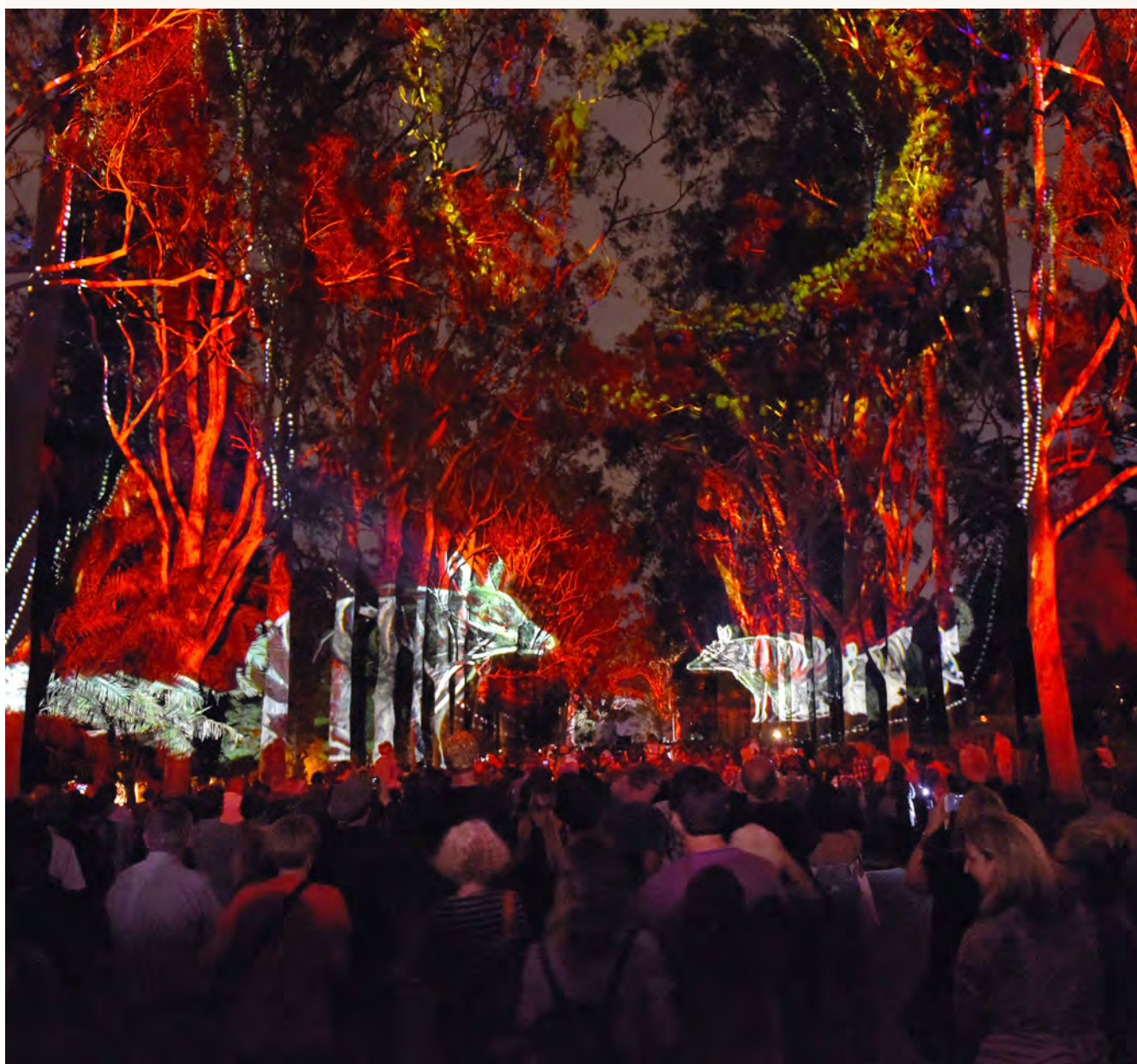
Boorna Waanginy: The Trees Speak.

A magical and dramatic night-time experience had visitors to Perth as well as locals fall in love with Kings Park and our unique place in the world.