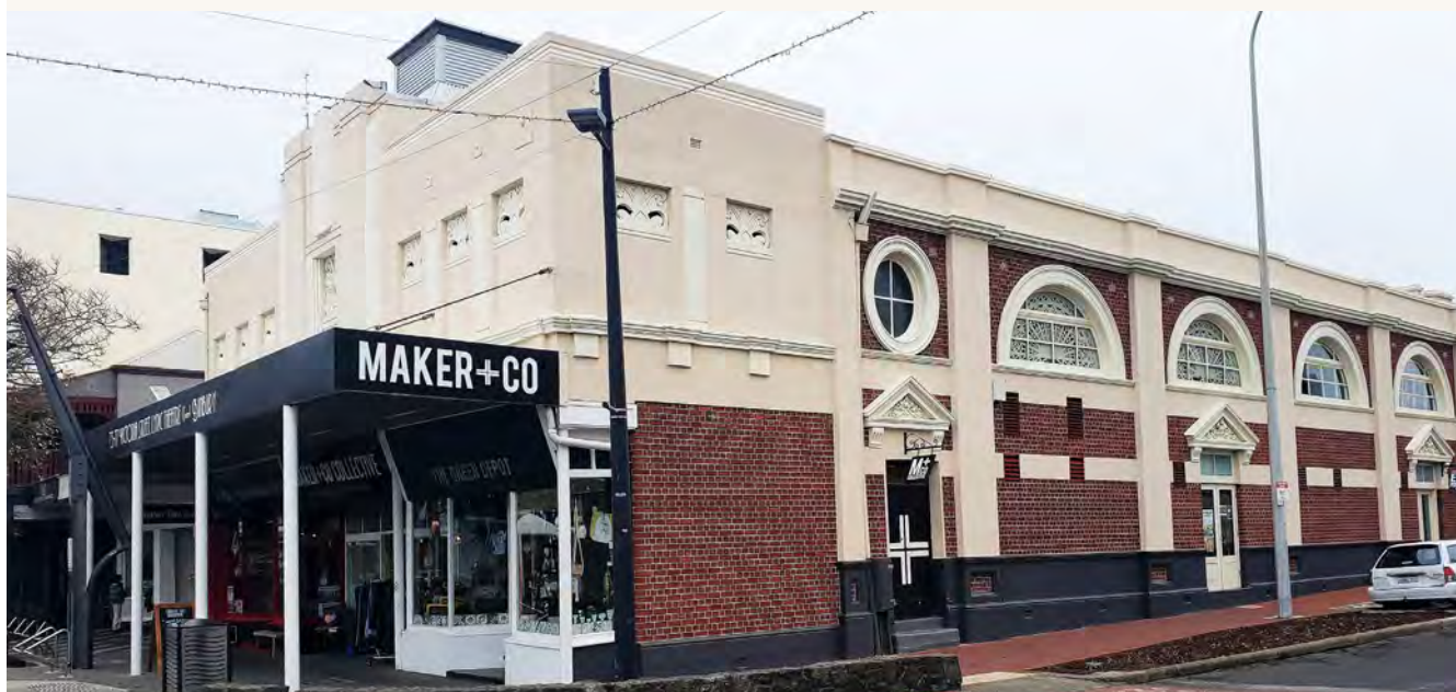
External image of the co-working space at Maker + Co, 75 Victoria Street, Bunbury, 2018.