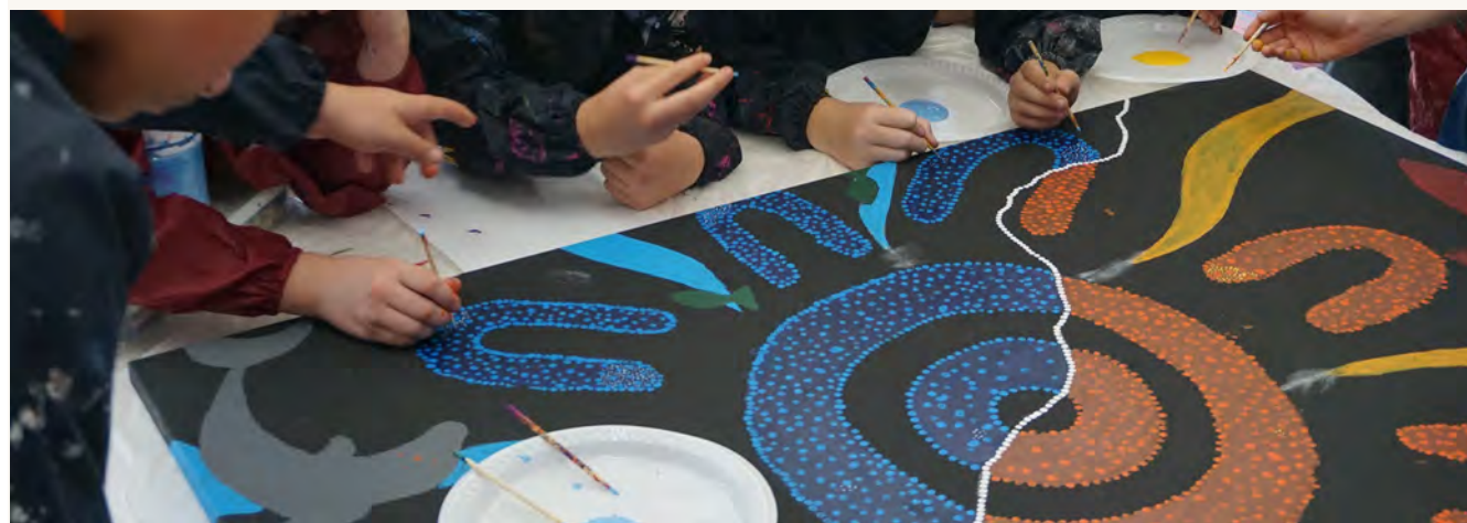
Left image: Alkimos Pop Up Library, Gateway Shopping Centre, Alkimos, 2018. Photo by City of Wanneroo. Top image: user borrowing items at the Self Check Terminal, Alkimos Pop Up Library, Alkimos Beach, City of Wanneroo, 2018, Photo by City of Wanneroo. Bottom image: Cultural Education Workshop, St James Anglican School, 2018.