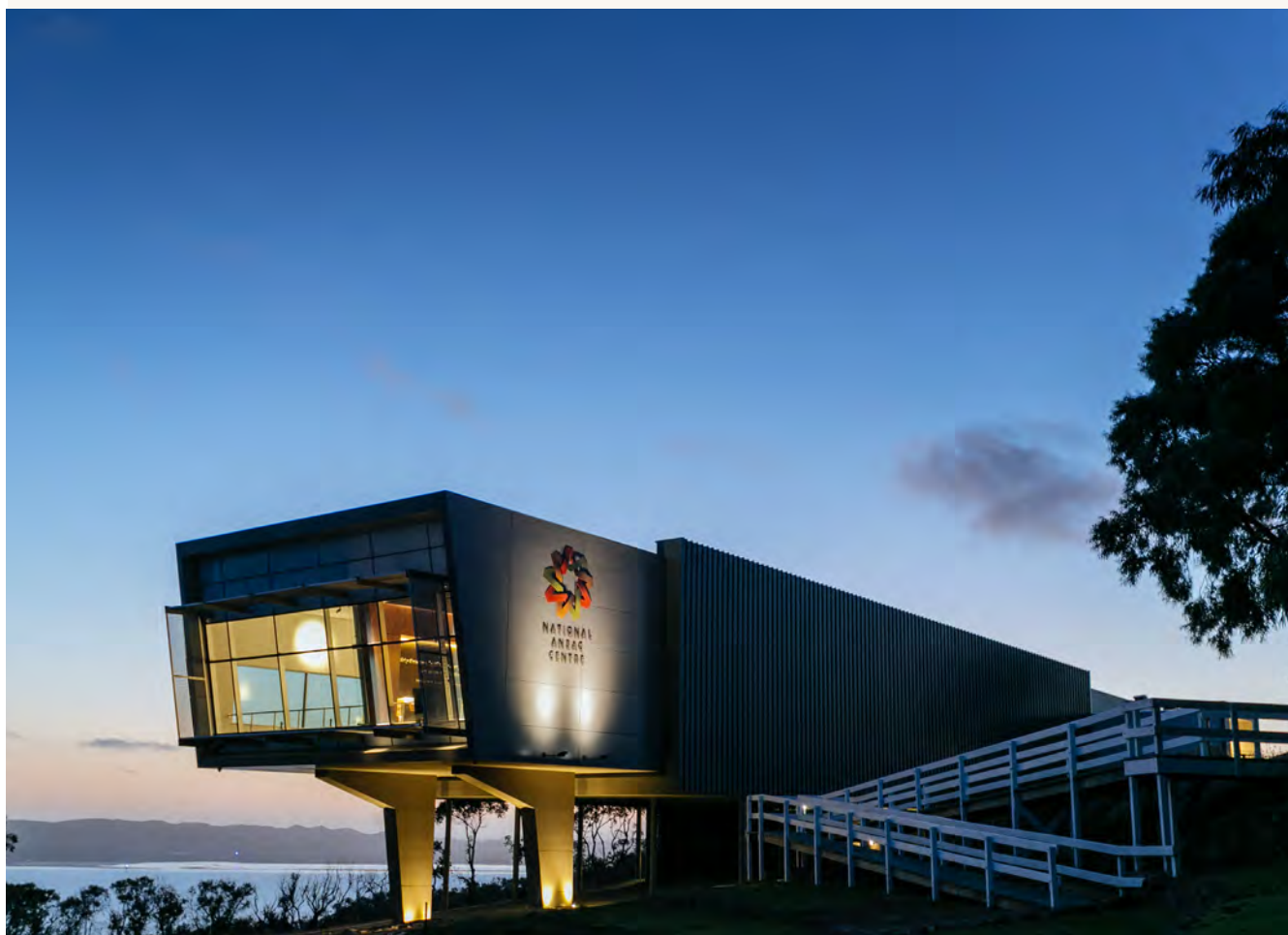
National ANZAC Centre.

The National Anzac Centre has won a variety of awards. Most recently, TripAdvisor's 2018 #1 Travellers Choice Award in Australia, #3 Travellers Choice Award in the South Pacific, and the 2018 Certificate of Excellence.