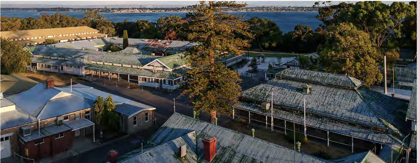
Sunset Heritage Precinct Drone Back View.