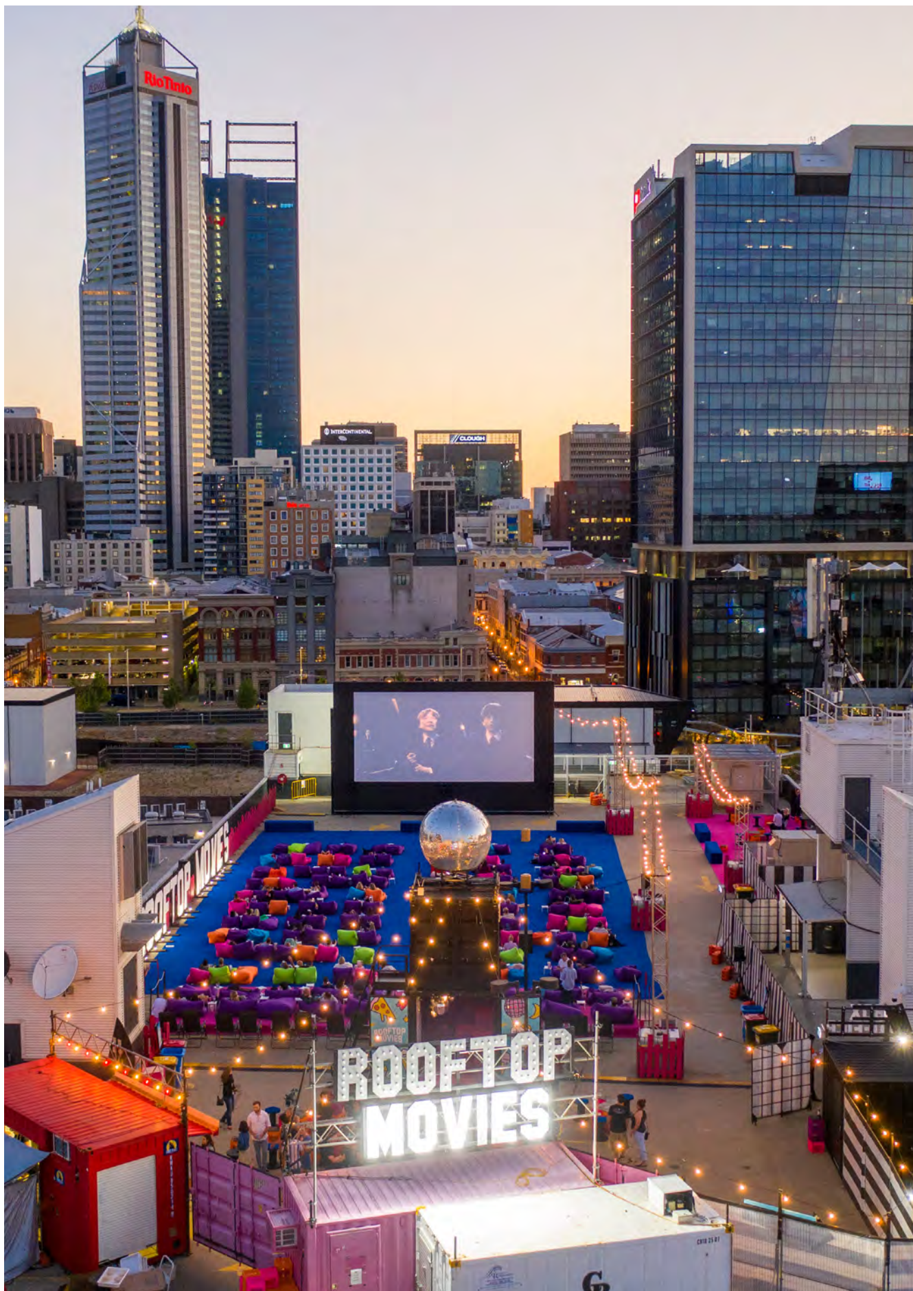
Rooftop Movies presented by ARTRAGE Inc