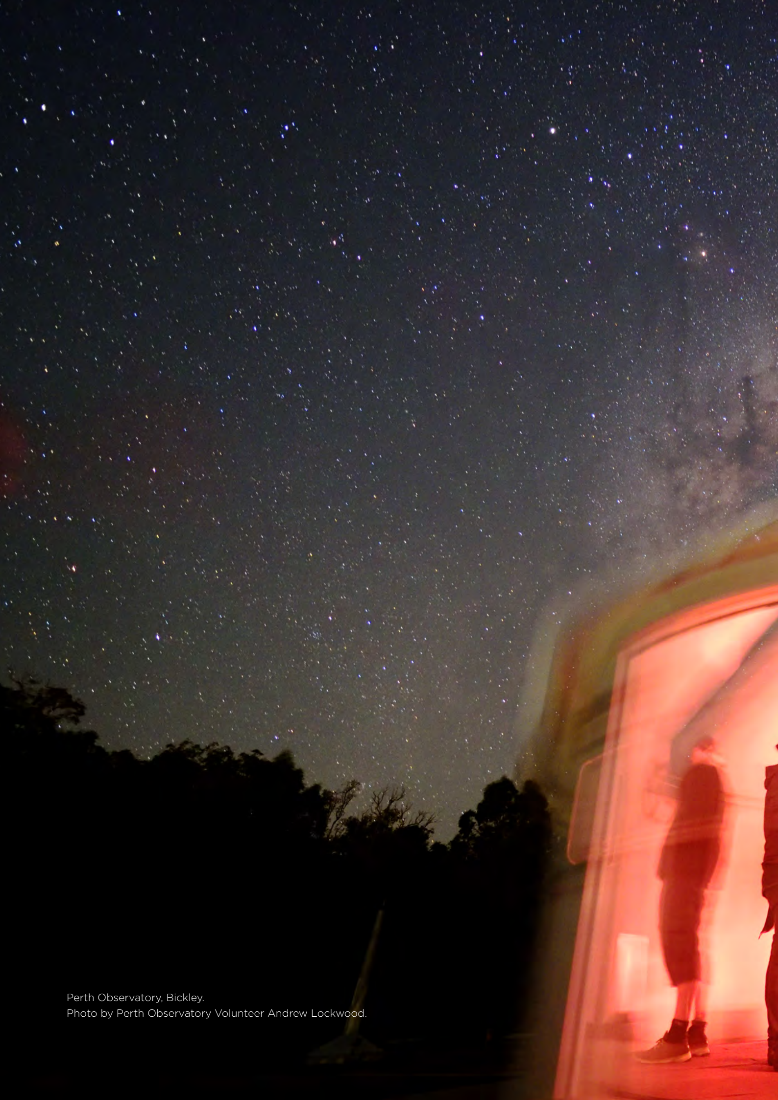
Perth Observatory, Bickley.