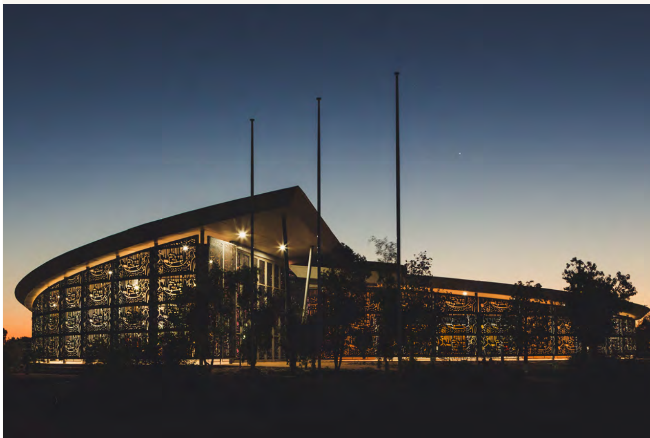
Gwoonwardu Mia—Gascoyne Aboriginal Heritage and Cultural Centre, Carnarvon, 2019.

The Western Australian Museum is working closely with the Gascoyne Development Commission and local Aboriginal communities to ensure the Centre can continue to be a meeting place for all people where Aboriginal culture is recognised and celebrated, and lives are enriched.